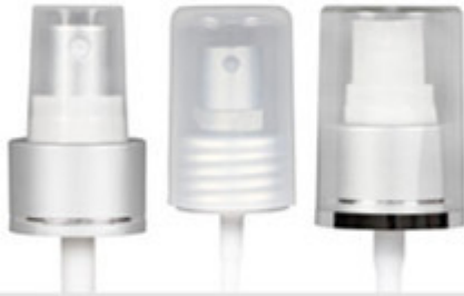
LSB-003 LSB-004 LSB-005